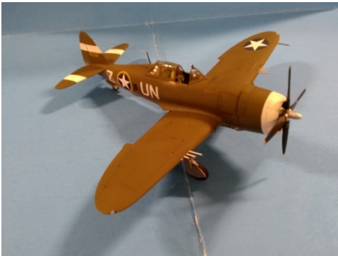
Rodney Carrier added Loon Models' cowling and replacement belly to make Tamiya's P-47 into a C-5.